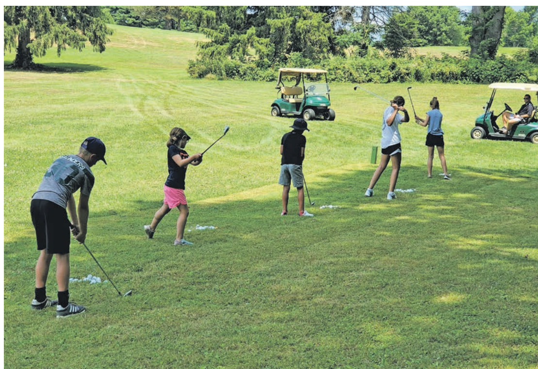
The MV Golf & Event Center is inviting junior golfers to a summer of fun with an option for both beginners and more experienced players. Players need to bring their own equipment.

Players need to bring their own equipment. To sign up or for more information call 315.823.0330.