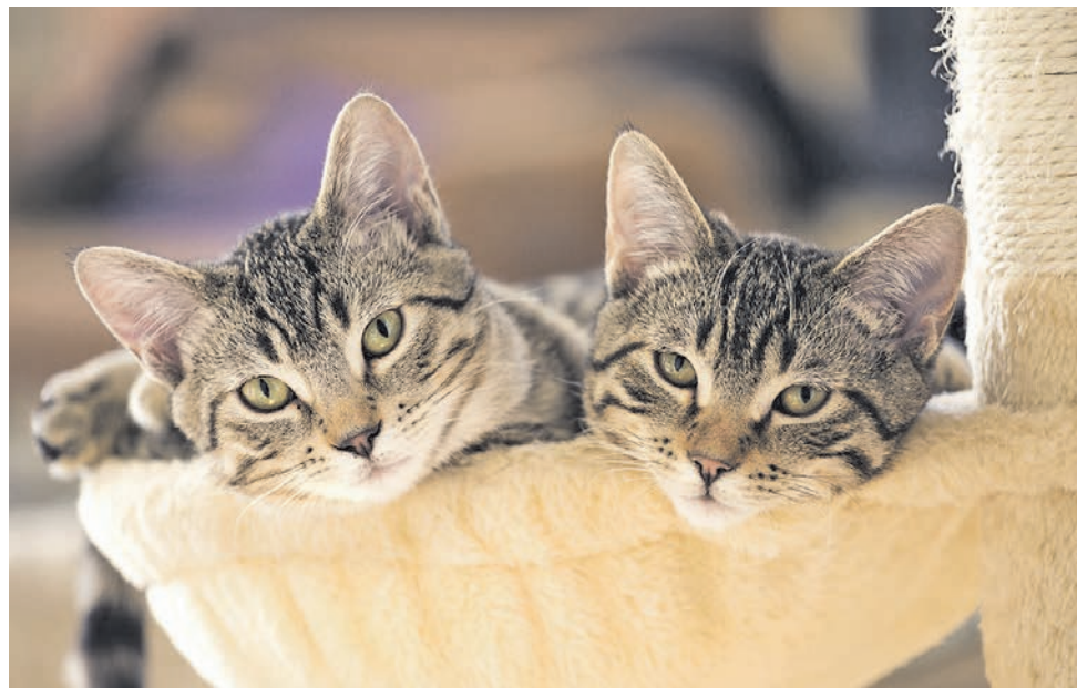
Pet owners can employ various strategies to keep their pets safe at home.

These strategies can reduce instances of pets wandering away from home.