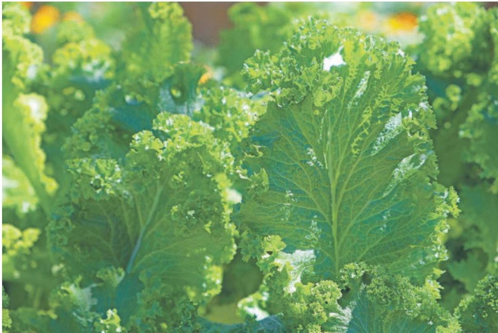
Kale can be planted in midsummer for a fall harvest as it grows well in cool weather, matures quickly and tolerates frost.

Otherwise, this is a great time to try a new variety, such as red Russian kale ( Brassica napus var. pabularia ) with light blue-green leaves and purple stems. With 50 days to maturity, this colorful variety is a good choice for direct seeding in midsummer and makes a stunning addition to any vegetable plot.