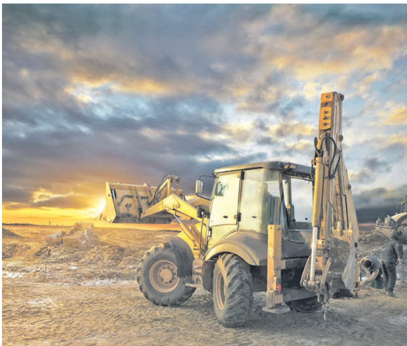
Excavation is a complicated process that may be necessary for projects big or small.

Skilled DIYers can tackle many home improvement projects on their own. However, the complex nature of excavation makes these types of projects the kind that are best left to skilled professionals.