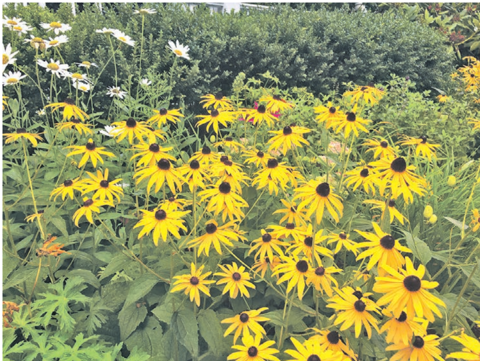
Certain care is needed to help perennials thrive, and that starts with the soil.

Apart from these strategies, perennials pretty much take care of themselves. As long as sunlight requirements match plant needs, the perennials should thrive.