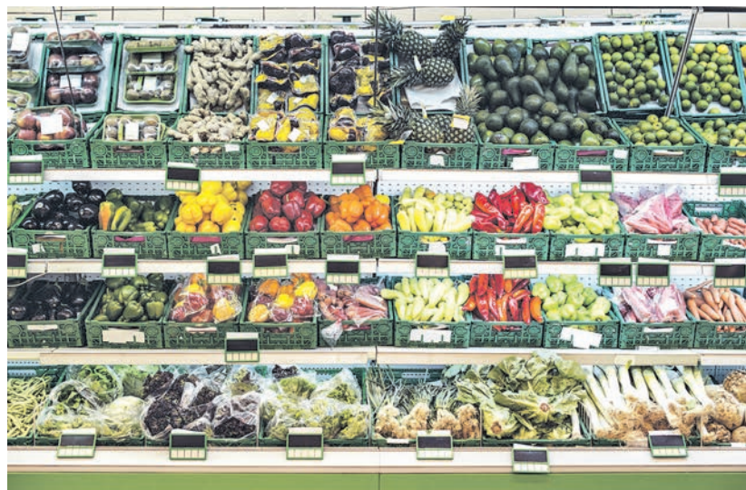
Learning more about produce can help people diversify their gardens and make for tastier meals.

Fresh fruits and vegetables can be grown at home with relative ease. Home gardening also puts complete control into the hands of individuals who want to know how the foods they eat were grown and treated, providing a greater measure of control over their diets. A sense of pride also comes from having a thriving garden in the backyard.