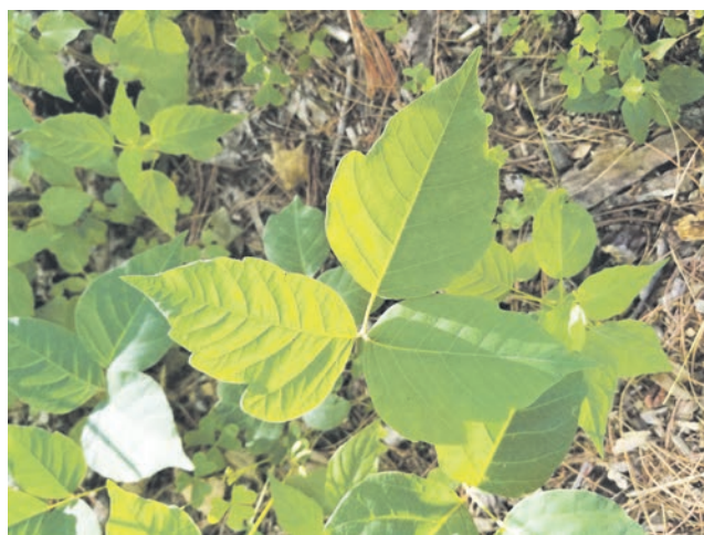
Poison ivy, recognizable by its leaves of three, thrives in a number of different habitats from backyards to wooded areas.

For more information on poison ivy and its control, consult the guidelines at bit.ly/3xoWraB .