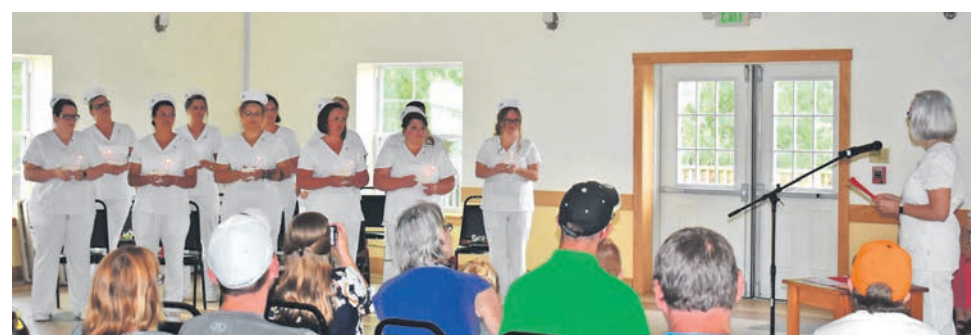
Herkimer-Fulton-Hamilton-Otsego BOCES Adult Practical Nursing Program students in the part-time day program participate in a candle-lighting ceremony during the 57th Commencement and Pledge Ceremonies on in July at the German Flatts Town Park.