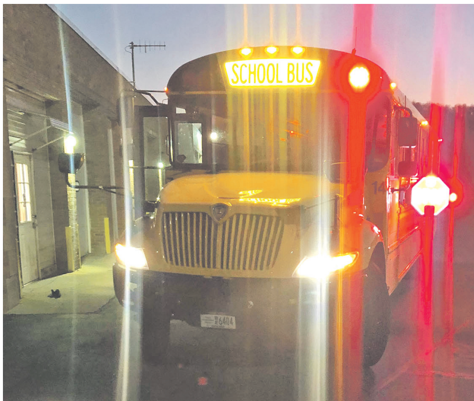
One of Poland Central School District's two new 2021 school buses with LED lighting systems in the "School Bus" signs and stop arms is pictured here at night.