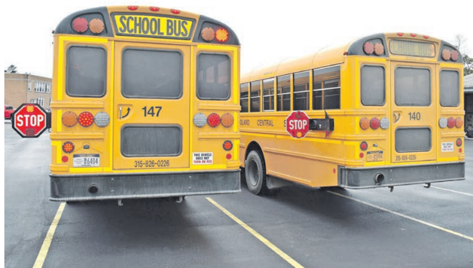
The back of one of Poland Central School District's two new 2021 school buses with LED lighting systems in the "School Bus" signs and stop arms is pictured here on the left. On the right is a 2018 bus without the LED lighting system for a daytime comparison.