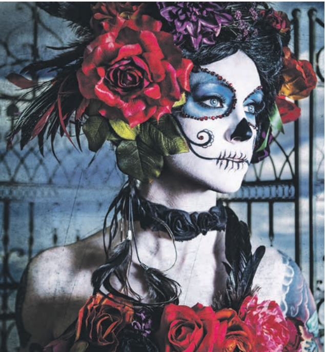
Read ingredients and check safety information for Halloween makeup to ensure it is safe to use on certain areas of the face.

Contact the Commercial Print Department For More Information 518-673-0171 • commercialprint@leepub.com