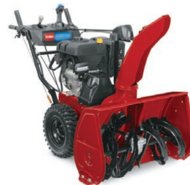
Model shown 38842