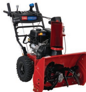
Model shown 37802