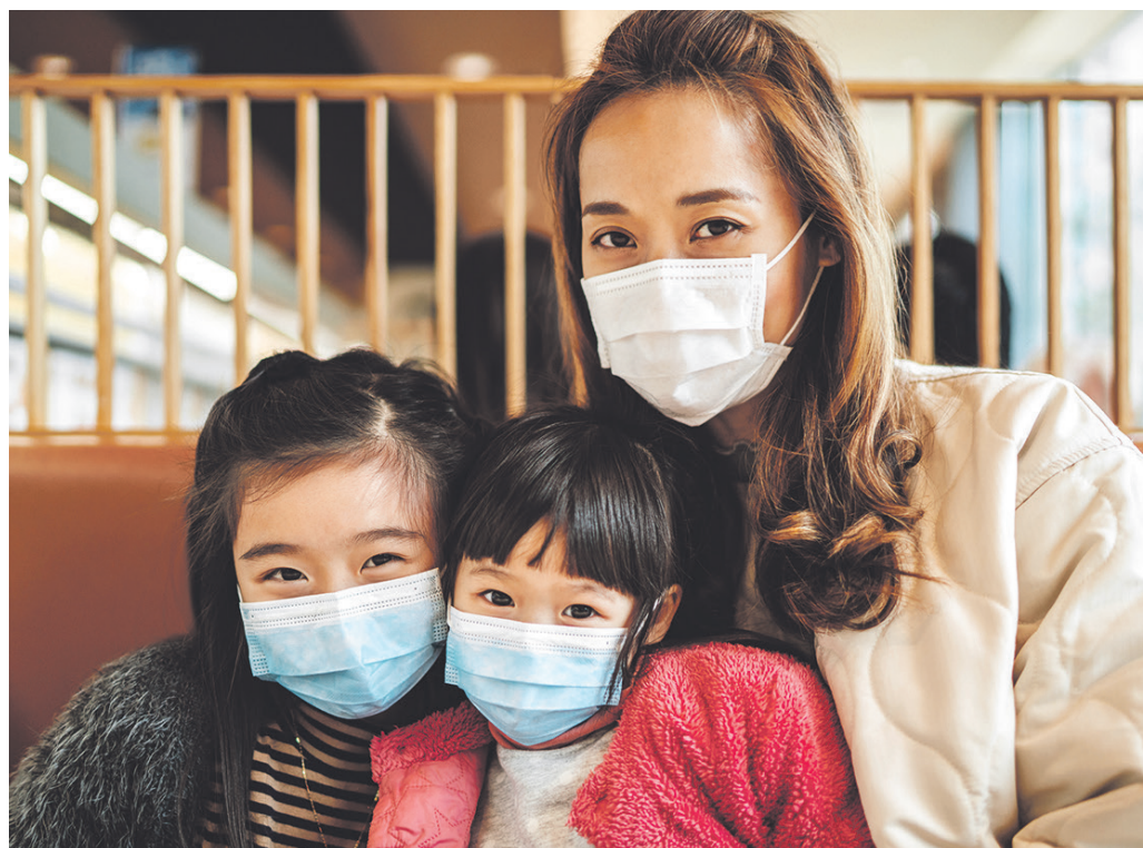
Parents can weigh the risk/reward of dining out with unvaccinated children and take as many precautions as possible to keep them healthy.

Dining out with unvaccinated children requires parents to carefully assess risk and make decisions that keep their children as safe as possible.