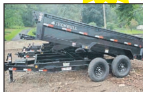
12 Ft. - 10K GVW