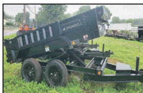
10 Ft. - 10K GVW