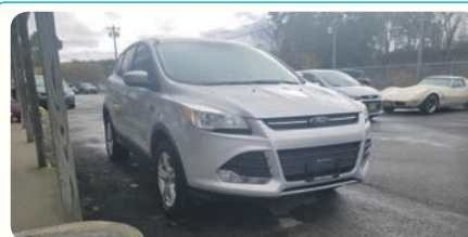
2013 Ford Escape 4x4 Very Nice SUV $7,995