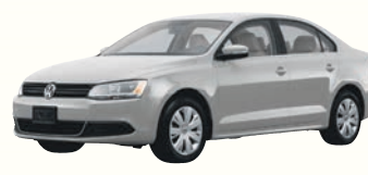
2013 VW Jetta Extra Nice, Clean Car Very Good MPG $6,250