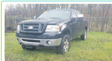
2004 Ford F250 Runs Great, Excellent Work Truck $4,500