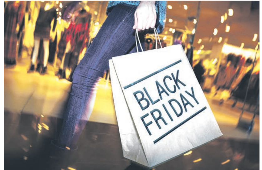
Shoppers may benefit from a refresher course on how to get the best Black Friday deals.

mal in 2021 than it did a year ago. Consumers can capitalize on Black Friday sales by revisiting some old shopping strategies and embracing new ones as the 2021 holiday season begins.