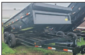
14 Ft. - 14K GVW