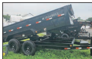
16 Ft. - 14K GVW

All Dump Trailers Have Tarp Kits and Spreader Gate