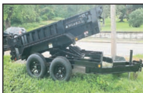
10 Ft. - 7K GVW