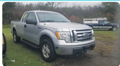
2011 Ford F150 Super Cab 4x4, Nice 5.0 Motor $11,700