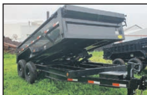
16 Ft. - 14K GVW