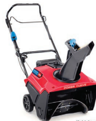
Model shown 38756