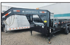
Gooseneck 14 Ft. - 14K GVW