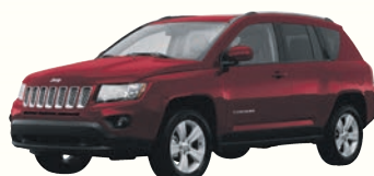
2014 Jeep Compass 4x4 Very Good Gas MPG $7,995