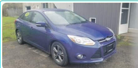
2012 Ford Focus Nice Looking Car Very Good Gas MPG $6,250