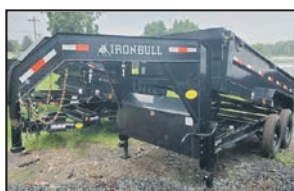
Gooseneck 16 Ft. - 14K GVW