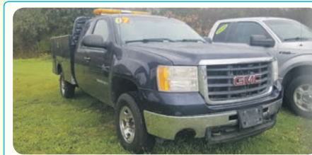
2007 GMC Work Truck With Utility Box New Jersey Truck - No Rust $6,250