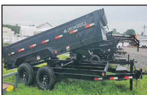
14 Ft. - 14K GVW