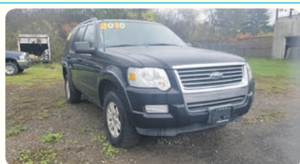
2010 Ford Explorer 4x4 High Mileage, Runs Excellent $6,250