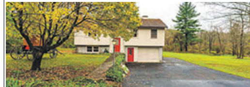
#202131139: A perfect setting comes with this raised ranch home located on 1.4 acres. Open kitchen, living room, dining area, and a huge family room. Large covered back deck for outdoor entertainment. Full basement, dug and drilled well. $169,000