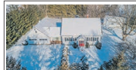
#202211129: Welcome home! Nestled in and tucked away from the road you'll find this roomy 4 bedroom, 2 1/2 bath home waiting for its new owners to call home. Situated on 6.5 acres w/ road frontage on 2 roads. 20x30 outbuilding with electric. Eat-in kitchen, a roomy living room and dining area for gatherings with friends and family. When days are cool, enjoy relaxing in front of your wood burning fireplace. The full basement offers even more possibilities. Breezeway leads to the 2-stall attached garage. Close to Cooperstown, the Adirondacks and the Capital District. Convenient to all major routes. $275,000