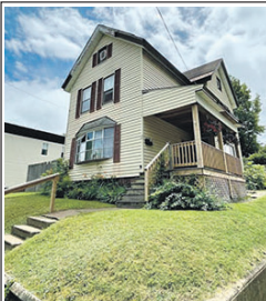
#20212985: Cozy yet, spacious home on a corner lot, close to downtown amenities. Take advantage of the fully fenced in yard, perfect for entertaining or enjoy the new front porch. This home features an eat in kitchen first floor laundry and central AC. Garage door was installed four years ago and a new electric hot water heater just installed. The roof is at the end of its life and will need to be replaced. Agent is related to seller. Call today for a showing! $95,000