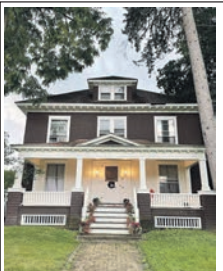
#202128079: Are you looking for the perfect home for entertaining? Well here it is! This home features an open concept first floor, complete with a full bathroom. Spacious master bedroom complete with an en suite. Updates include mahogany countertops, convenient second floor laundry and custom coffered ceilings. Walking distance to Knox Field. All you have to do is add your finishing touches and this home will feel like yours! Call for your private showing today! PRE APPROVED BUYERS ONLY. Agent is related to seller. $275,000