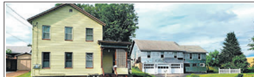
#202123794: Ideal for an owner occupied 2-family or easily convert into a single family home! This great location featuring a large yard, walking distance to the school and beautiful park. Home has been well cared for and updated including windows, siding and roof. Very large garage with a workshop and plenty of storage on the 2nd floor. Commute to Albany, Utica or Saratoga. $115,000