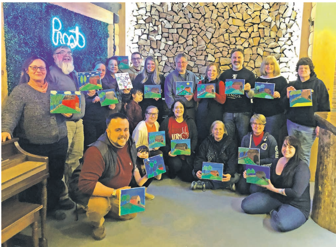
Proud participants show off their masterpieces.