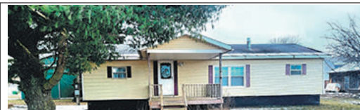
#202210661: Homesteading is possible with this property! story home with 4 bedrooms. Many outbuildings include 40x30 barn, silo, pole barns, and 1 stall detached garage. $164,900