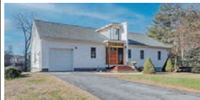
#202133710: This stunning home located on Northville Lake has been beautifully remodeled. This contemporary lakefront home is everything you have been looking for. The open floor plan offers mesmerizing views of the lake with 2 bedrooms and 2 full baths on the first floor and upstairs features a huge loft bedroom and full bath with a walk-in tile shower and a huge unfinished room that could be turned into a fourth bedroom or home office. 100ft of direct lakefront! HRRD permit is $87 per year. Schedule a showing today. Deeded Access W/Dock $450,000