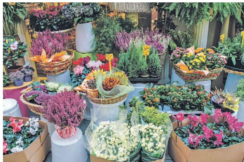
Beautiful interior flowering plants can be an alternative to a bouquet of roses as a Valentine's Day gift.

Civic-minded sweethearts may appreciate the thought of donating the time and money they might normally spend on a restaurant meal by helping to ensure needy children and adults have access to hot meals. The Feeding America network is a nationwide network of food banks that secures and distributes meals. Individuals can learn more