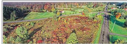
#202129905: Build your dream home or hunting camp here. 14.75 acre lot with 1400 ft road frontage on State Rte 30A and 920 feet road frontage on Esperance Rd. Approx 324 acres of state land just 3 or so miles north on 30A of this land. $46,500