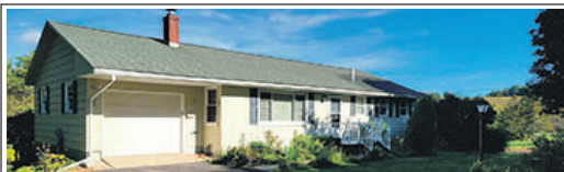
#202129063: This beautiful ranch home checks all of the boxes! Location, gorgeous landscaping, updated and maintained are just some of its attributes. Recessed lighting throughout the home. Full walk out basement with great potential, easily could be finished off! Property close to historical village of Cooperstown. Very Good Condition $235,000