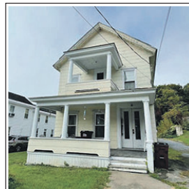
#202130195: Here is a great opportunity for an owner-occupied rental. Lower unit is very spacious, featuring 3 bedrooms and a large dining area. Upper units are completely vacant and easy to show. Attached to the third unit is an extra room, perfect for additional storage. Plenty of off street parking, including a carport! Each unit has their own electric and gas meters that have been updated! $79,900