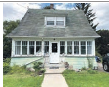
#202129183: View this home to appreciate the charm inside this cottage style dwelling. Hardwood floors throughout, along with original woodwork & doors. Almost all windows have been replaced, new furnace. The extra room downstairs can be a 3rd bedroom or office space. It features a full bath upstairs and downstairs. Repair or replace the large deck on the back for extra outdoor enjoyment. Relax on the enclosed front porch entrance also. A great location on quiet street. Complete the mostly cosmetic repairs to restore this home to its full potential! Only a few blocks to schools! Fair Condition $69,000