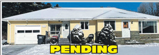
#202210410: Come relax in this ranch set on over an acre, just a mile away from Route 30 shopping. One car attached garage with mud room and two bedrooms and an office on the first floor with full basement just waiting to be finished. $168,500