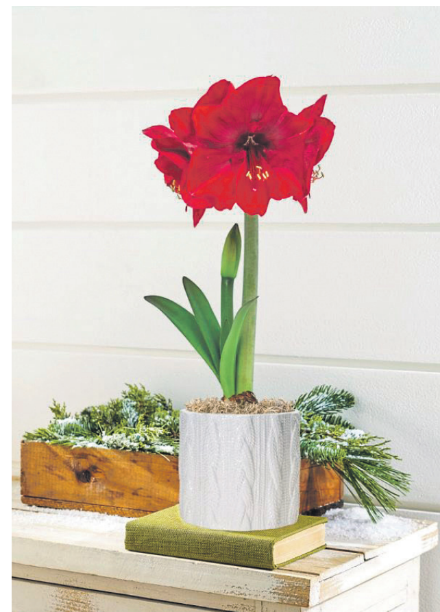
Showy amaryllis for Valentine's Day.

Many of the bulbs are sold already potted up in