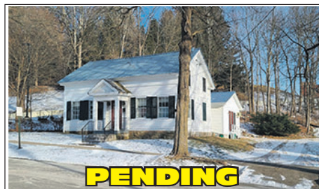
#202211001: Cozy, two-bedroom home located in the village of St. Johnsville. In 1989, a large, one-room addition was built, with vaulted ceilings, wood beams and hardwood floors. Also on the first floor, an eat-in kitchen, full bathroom, living room, and dining room. Two bedrooms are on the second floor. Small fenced in area on the side of the house, perfect for pets! Both off-street and street parking available. Location is perfect, close to the high school and 2 blocks from main street. Call today for a private showing! $69,000