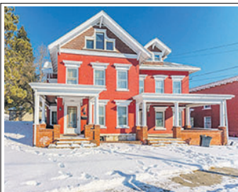
#202117592: Brick Victorian style home with a huge detached garage. Features high ceilings, open staircase, hardwood floors, stain glass windows, large formal living rooms, French doors, and many nooks and crannies. 2 front porches. Paved driveway with carport. $179,900