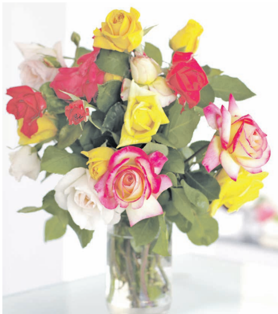
Flowers traditionally are given for Valentine's Day, Mother's Day, anniversaries, and other special events.

These steps can add life to cut flowers, helping arrangements thrive in any home.