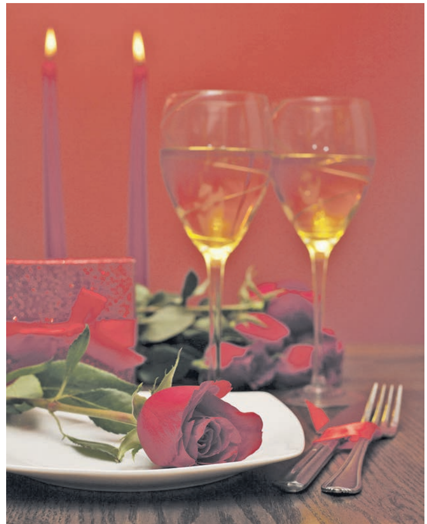
Homemade desserts can be a great way to show that special someone just how much they're loved.

Cutting butter into small cubes and arranging them in a single layer will help them soften more quickly.