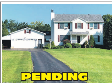
#202210478: This beautiful home with 4 bedrooms and 2.5 baths is nestled on 5.6 acres in a quiet neighborhood in the charming hamlet of Tribes Hill. Its spacious kitchen has been updated with granite countertops, stainless steel appliances, including a gas stove. Other features include: hardwood floors, tiled bathroom floors, separate mudroom, large Master Suite with a walk-in closet, pellet stove, enclosed storage attached to the garage, storage shed in the back, and finished basement with a gas stove. Along with a large back deck, the yard is beautifully landscaped and the roof is only 5 years old. Also, the owners have added air/heat/dehumidifier split units on 2 floors and a new front porch. Easy access to All the Distribution Centers, Route 5, NYS Thruway Exits 27 and 28. $355,000