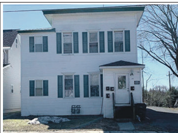
#202115206: Great income opportunity!! This 4 unit property has 2/1br and 2/2br apartments. Close to all amenities with in walking distance. 3 units are leased one unit is owner occupied. Must see!! $185,000